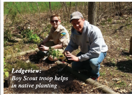
Ledgeview: Boy Scout troop helps in native planting

Winning applicants will be chosen on the basis of creativity, impact on the community, complete and thoughtful planning, and wise budget use.