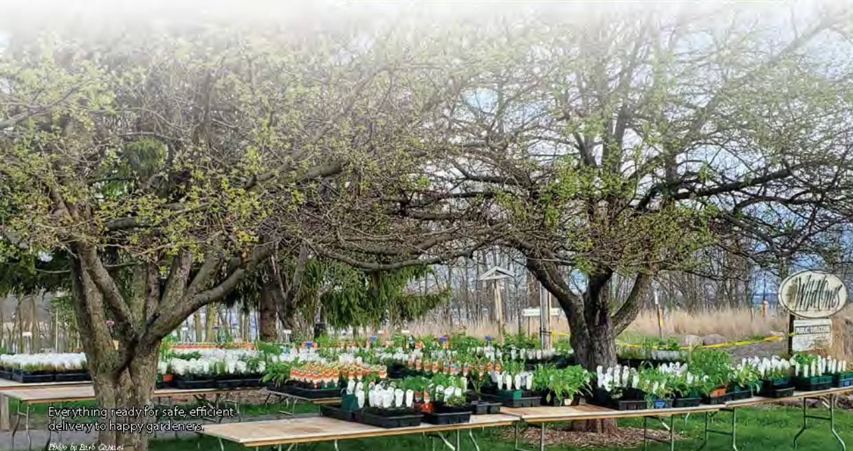
Everything ready for safe, efficient delivery to happy gardeners.