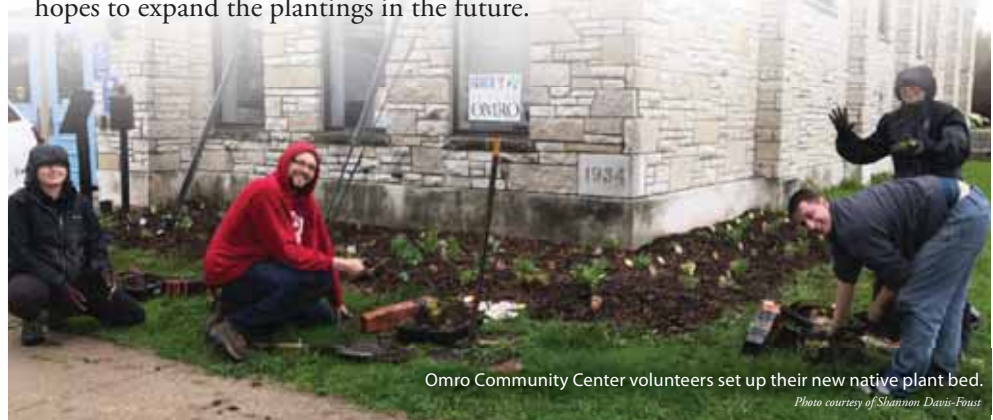
Omro Community Center volunteers set up their new native plant bed.