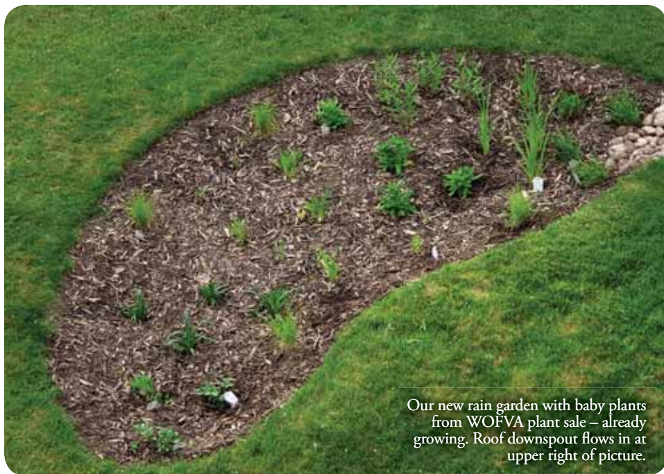
Our new rain garden with baby plants from WOFVA plant sale – already growing. Roof downspout flows in at upper right of picture.

Thanks to WOFVA from both of us for the chance to serve you and give back a little of the abundance we have received through our connection with this wonderful organization. (We had fun at the Sullivan's Woods, the Navarino walk and the plant sale).