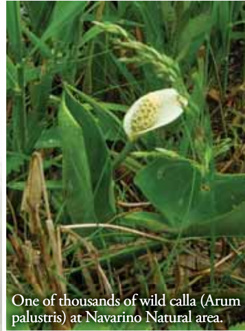
One of thousands of wild calla ( Arum palustris ) at Navarino Natural area.

Rob urged us to come back every two weeks during the year as the plants and animals change so often given the wide range of habitats within the property. For example, there is a large grove of witch hazel ( Hamamelis virginiana ) which will be spectacular in November when its late yellow flowers open.