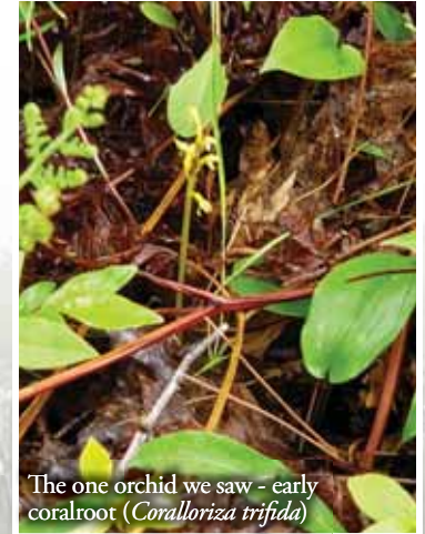
The one orchid we saw - early coralroot ( Coralloriza trifida )