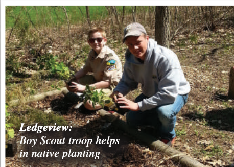
Ledgeview: Boy Scout troop helps in native planting

Winning applicants will be chosen on the basis of creativity, impact on the community, complete and thoughtful planning, and wise budget use.