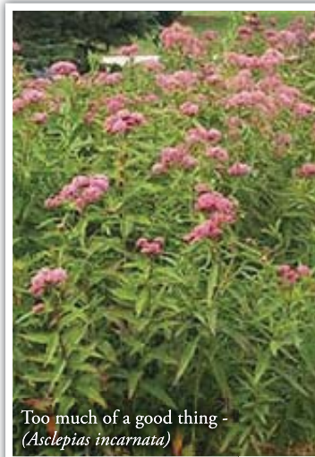
Too much of a good thing - ( Asclepias incarnata )

We may need to reduce or simplify our current activities to make room for new ideas. That was the reason for the survey and we appreciate everyone who took the time to respond. But we can't continue to grow without your help. Talk to a board member at a Chapter meeting or send an email to wildonesfoxvalley@gmail.com to let us know what you're interested in doing. Most importantly, thank you for your support of Wild Ones. We are healing the earth one yard at a time.