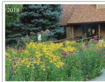
( Top ) 2014 summer view of a rain garden. See clump of sweet black-eyed Susan ( Rudbeckia submentosa ) at center-back of the garden. ( Bottom ) 2018 view of same garden. Now the sweet black-eyed Susan seems to have taken over and the variety of the other plant species can barely be seen.