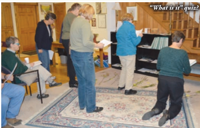
"What is it" quiz?