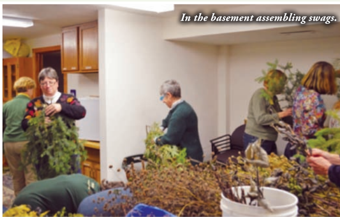
In the basement assembling swags.