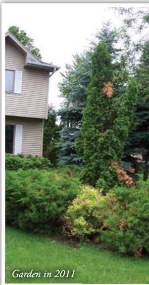
Garden in 2011

Aster ( Symphyotrichum lateriflorum ) and non-natives, such as Ligularia ( Ligularia 'The Rocket' ), most of the Lamb's Ear ( Stachys byzantine ), Miscanthus grass ( Sinensis purpurascens ), Artemisia Silver Mounda ( Artemisia schmidtiana ) and Creeping Bellflower ( Campanula rapunculoides ). I also moved and divided a Carolina Rose ( Rosa carolina L. ) and reduced the number of Coneflowers ( Echinacea 'PowWow Wild Berry' ). After shopping at the WOFVA Plant Sale Trail in May, I bought and added more showy goldenrod types, Stiff Goldenrod ( Solidago rigida ), Riddell's Goldenrod ( Solidago riddellii ), plus Rough Blazing Star ( Liatris aspera ), New Jersey Tea ( Ceanothus americanus ), Purple Poppy Mallow ( Callirhoe involucrate ), Lanceleaf Coreopsis ( Coreopsis lanceolata ), Purple Prairie Clover ( Dalea purpurea ), Royal Catchfly ( Silene regia ) and Hoary verbain ( Verbena stricta ), all identified to attract butterflies. Having knowledgeable members and a wide variety of native plants at the WOFVA Plant Sale Trail helped in my selection, plus I had done some research before going.