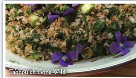
Tabbouleh Gone Wild