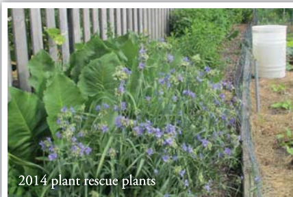
2014 plant rescue plants

I have been using native plants for many years, BUT I have learned that not all native plants work in every setting. I haven't always been satisfied, because some natives are renegades, creeping into other gardens, and even into my neighbor's vegetable garden under a fence. Sometimes, the gardens look too wild, unkempt and messy for my desires in a suburban landscape.