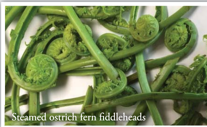
Steamed ostrich fern fiddleheads

Joy also shared best practices for foraging and cooking with wild plants: where to collect plant parts, conservation practices, identifying edible wild plants, resources for identification and uses of edible wild plants as well as the recipes she used to prepare the dishes. Thank you, Joy for sharing your research, prepared foods, and recipes. What an opportunity you provided to attendees!