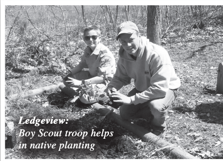
Ledgeview: Boy Scout troop helps in native planting

Winning applicants will be chosen on the basis of creativity, impact on the community, complete and thoughtful planning, and wise budget use.